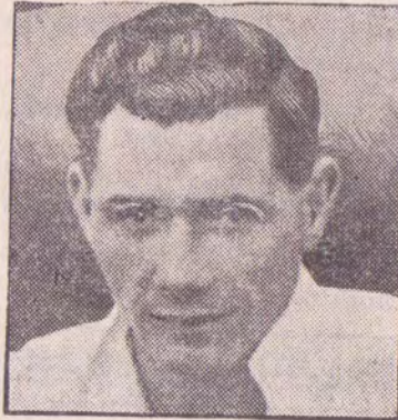
Photographs by courtesy of the "Yorkshire Evening Post"